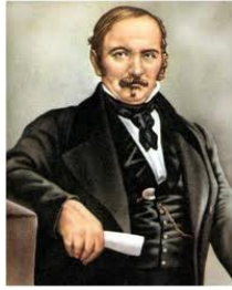
St. Allan Kardec