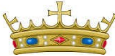
Coronet of a Vidame